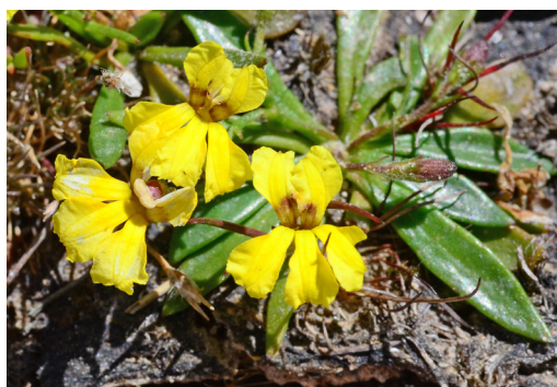
G & M Goods

BYO Water bottle/s, sunscreen, sunhat or raincoat